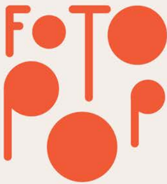
FOTO POP SPECIALIZES IN CREATING A SPACE TAILORED TO YOUR EVENT! CUSTOM TEMPLATES, BACKDROPS, AND PROPS. BOOTH + ON-SITE PRINTER, SOCIAL SHARING, HIGH-RES PRINTS, BOOMERANGS + GIFS, ONLINE GALLERY & MORE!